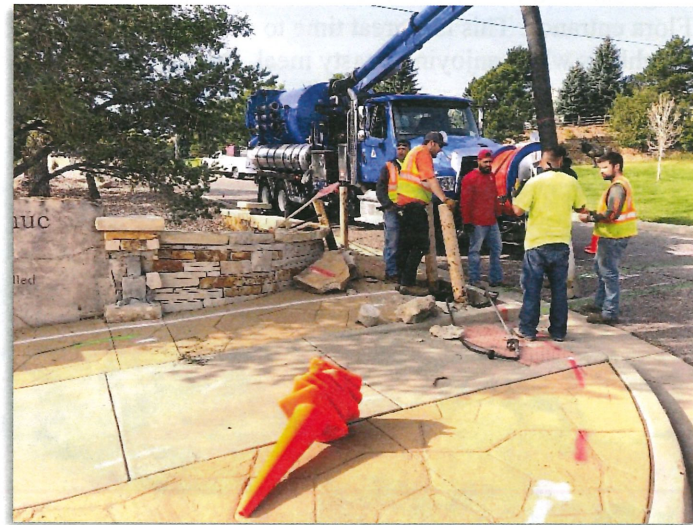
Thank you Foothills Parks and Rec For Replacing the Damaged Bollards at the Flora Entrance

We expect the project to be completed during the summer. In the meantime, neighbors can save well-loved books they would like to share with neighbors. Please place only titles of general interest in the sharing library. Books that do not get borrowed after a time will be removed and donated in order to keep a constant flow of fresh books in the library.